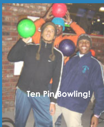
Ten Pin Bowling!