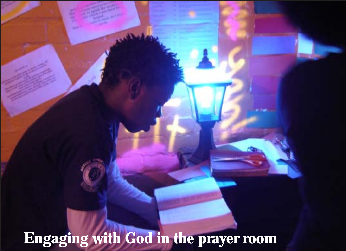
Engaging with God in the prayer room