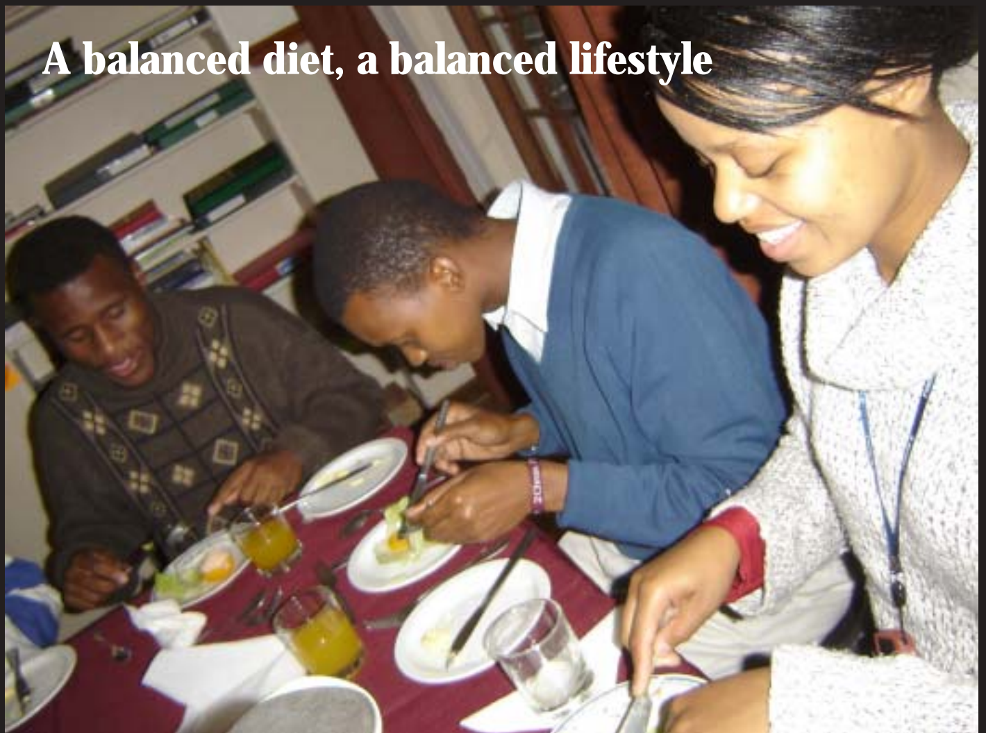
A balanced diet, a balanced lifestyle