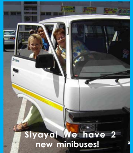
Siyaya! We have 2 new minibuses!